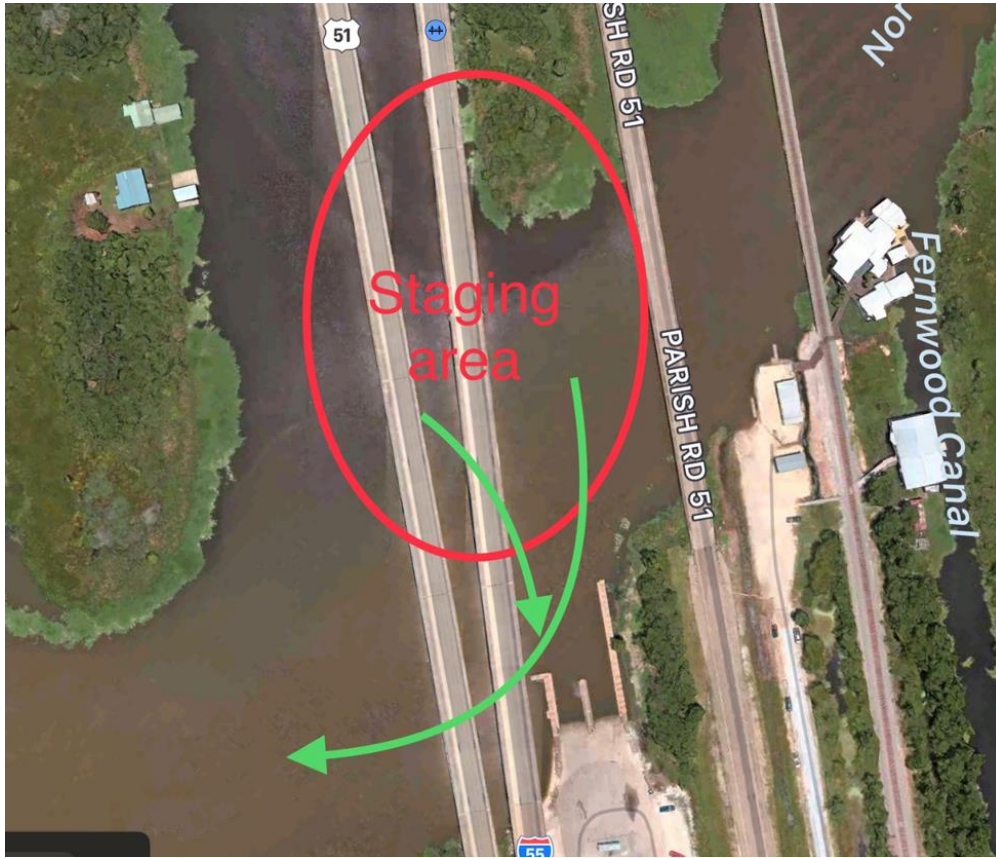
East boundary (There is no west boundary)